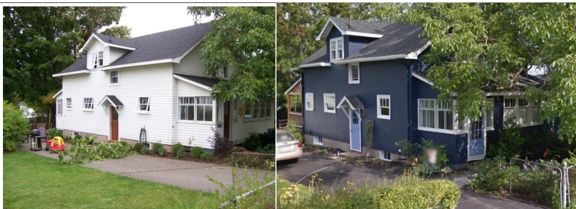
Date of Photo(s): 2013 and 2014

The building is centrally located in Port Williams within a historic residential area near the historic industrial waterfront and maintains a dominant character as an Arts and Crafts building with few exterior alterations.