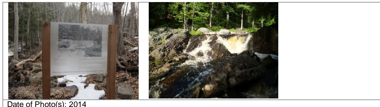
Date of Photo(s): 2014